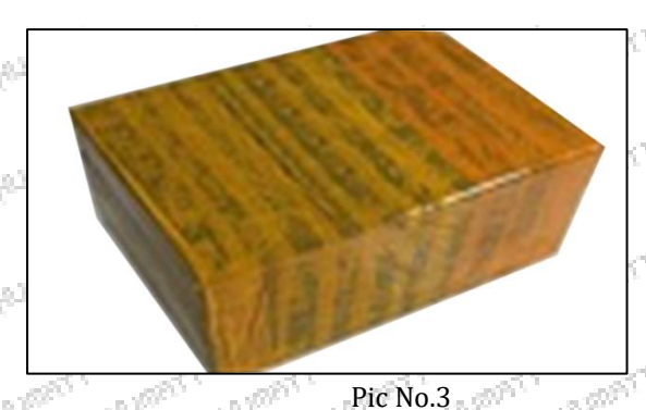
International express packaging: Wrapped with yellow tape after wrapping black protective film